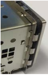
Figure 1: Standard gasket retention plate

Through extensive research and testing, TE engineers have redesigned two components to improve EMI performance. The first component identified was the gasket retention plate shown in Figure 1. This component acts as a backer plate for the conductive elastomeric gasket that interfaces with the inside of the front bezel. This retention plate was redesigned to utilize a right angle design with more attachment points to the cage body. These additional attachment points minimize the chance for EMI emissions to escape between the cage body and gasket retention plate. The redesigned gasket retention plate can be seen attached to the cage body in Figure 2.