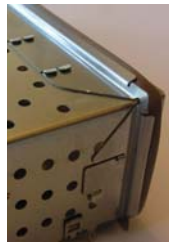
Figure 2: Right angle gasket retention plate

The second component that was identified for improvement was the latch plate, which is the component that separates the bottom port from the upper port. This component also houses the lightpipes that transmit light from LEDs mounted on the PCB to the front face of the cage assembly. Industry standards dictate the design of the latching mechanism so this was left unchanged, but within the latch plate a secondary component was added to improve EMI performance and prevent leakage. Since this component is integral to the cage body there is no difference in appearance or functionality between standard SFP+ stacked cages and SFP+ stacked enhanced cage assemblies. See Figure 3 for detail view of latch plate.