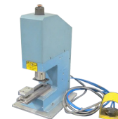
Part # 312522-1