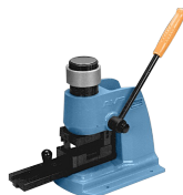
Part # 58024-1