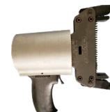
Part # 58075-1 (MTA-100) 58576-1 (MTA-156)